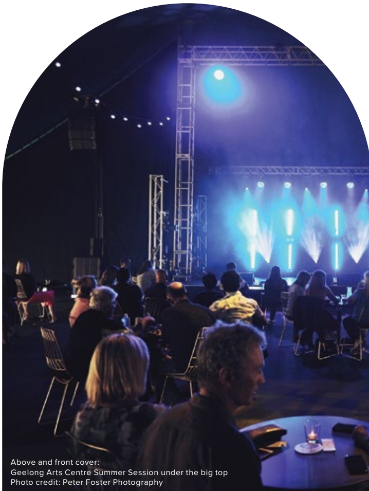
Above and front cover: Geelong Arts Centre Summer Session under the big top