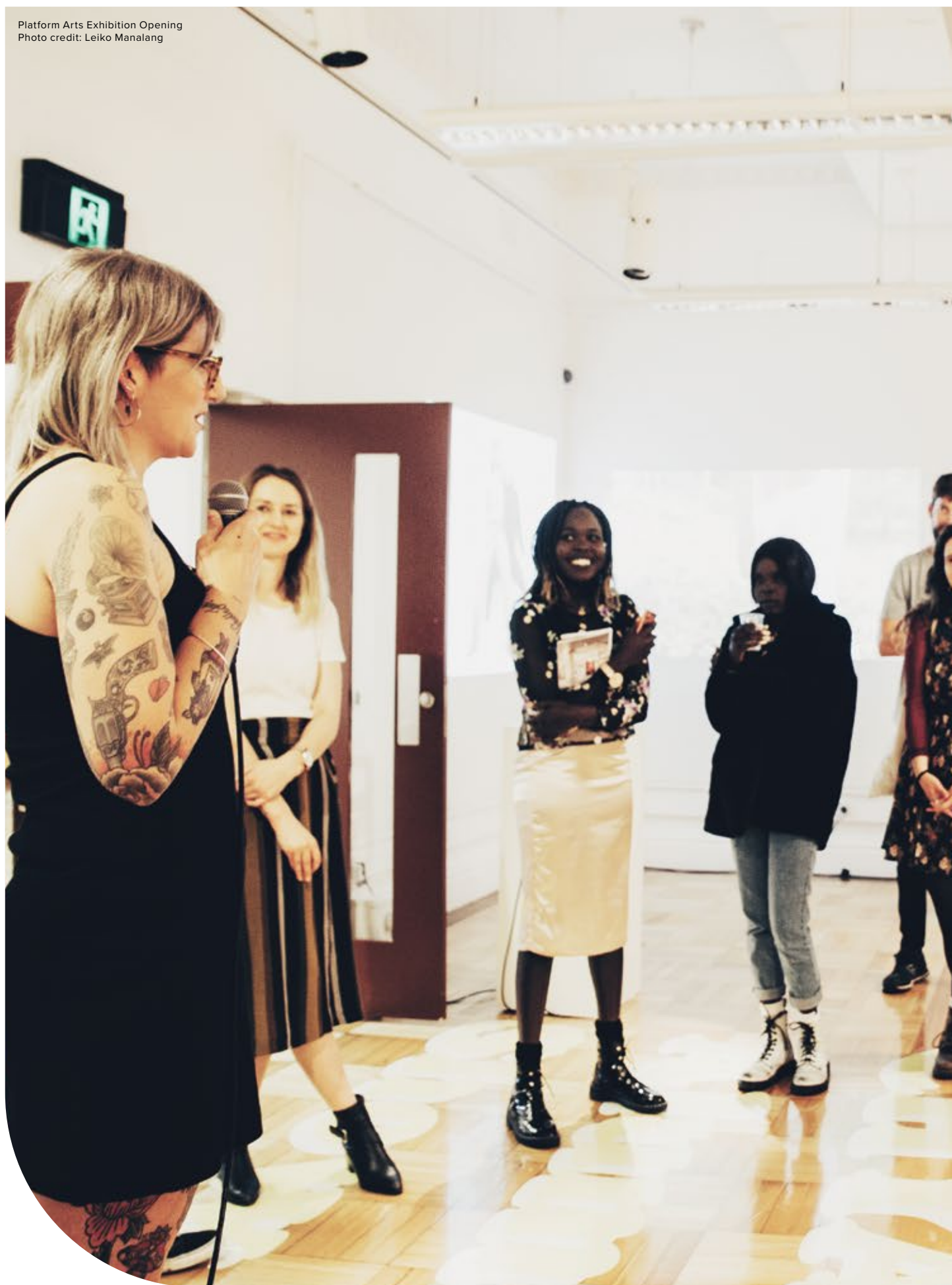
Platform Arts Exhibition Opening